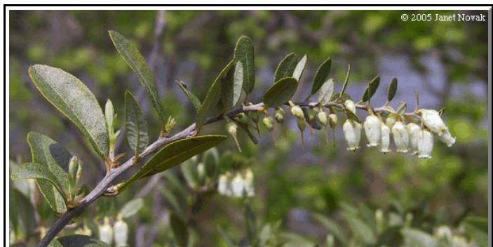
Leather Leaf Chamaedaphne calyculata

This rare shrub is one of the earliest 24-inch shrubs to produce flowers in the spring. The small white bell shaped flowers cover every branch, feeding hungry insects. The light green leathery leaves are one inch long and slender and are evergreen. The leaves are deep green throughout the summer and then brownish tan in the winter months. Plants thrive in wet conditions and will grow successfully in dryer soil types. Plants are cold hardy and can survive the cold temperatures. Zones 3-7