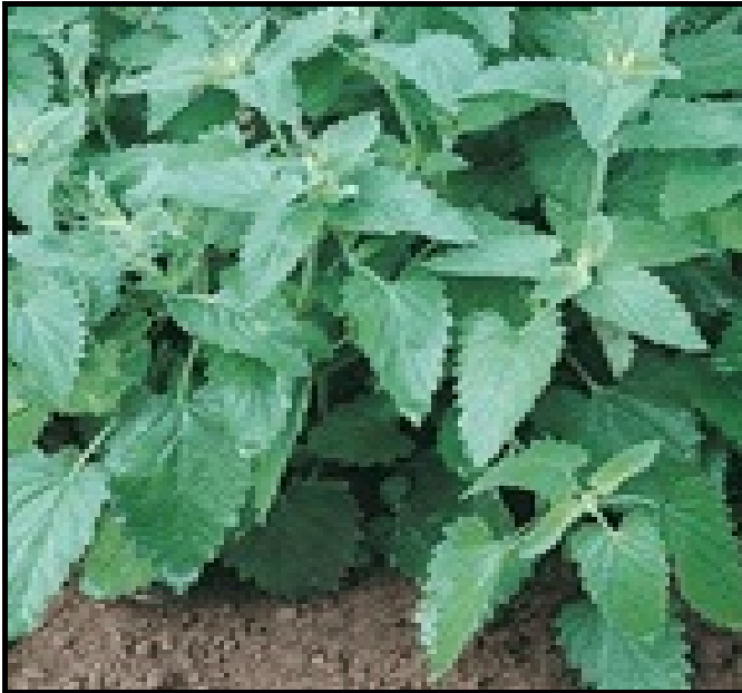
Catnip Nepeta cataria